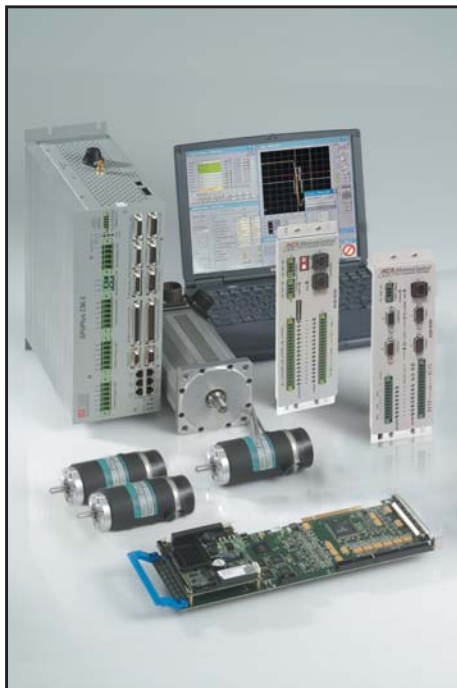
The SPiiPlus products family includes motion controllers, software tools, and expansion modules