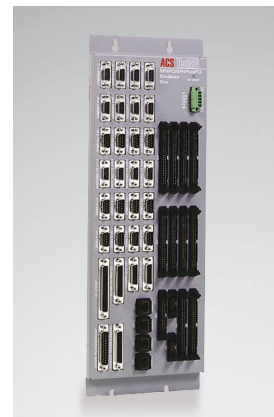
SPiiPlus Breakout Box for easy integration and cables connection

Dimensions: 175mm (6.88") x 345mm (13.58") x 40mm (1.57") [H x W x D]