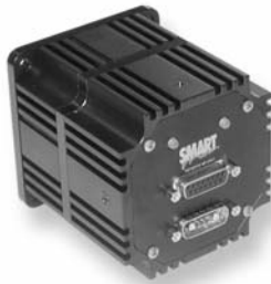
SM3410D shown with standard D-sub connector