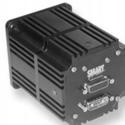
SM3420D shown with standard D-sub connector