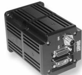
SM3420D-DNP shown with DeviceNet™ option "Plus" firmware