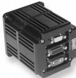
SM3410D-PBP shown with ProfiBus option "Plus" firmware