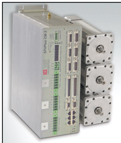
SPiiPlus CM-3 comprehensive motion control solution for three axes