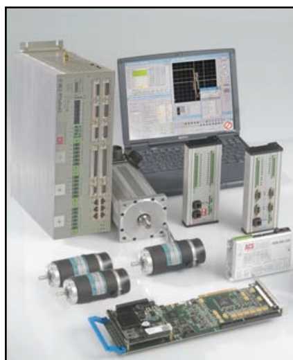
SPiiPlus CM is part of the SPiiPlus line of motion control products & software tools